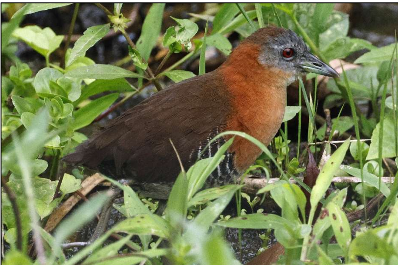
To our delight, a White-throated Crake came right out in the open outside of Bogarin.