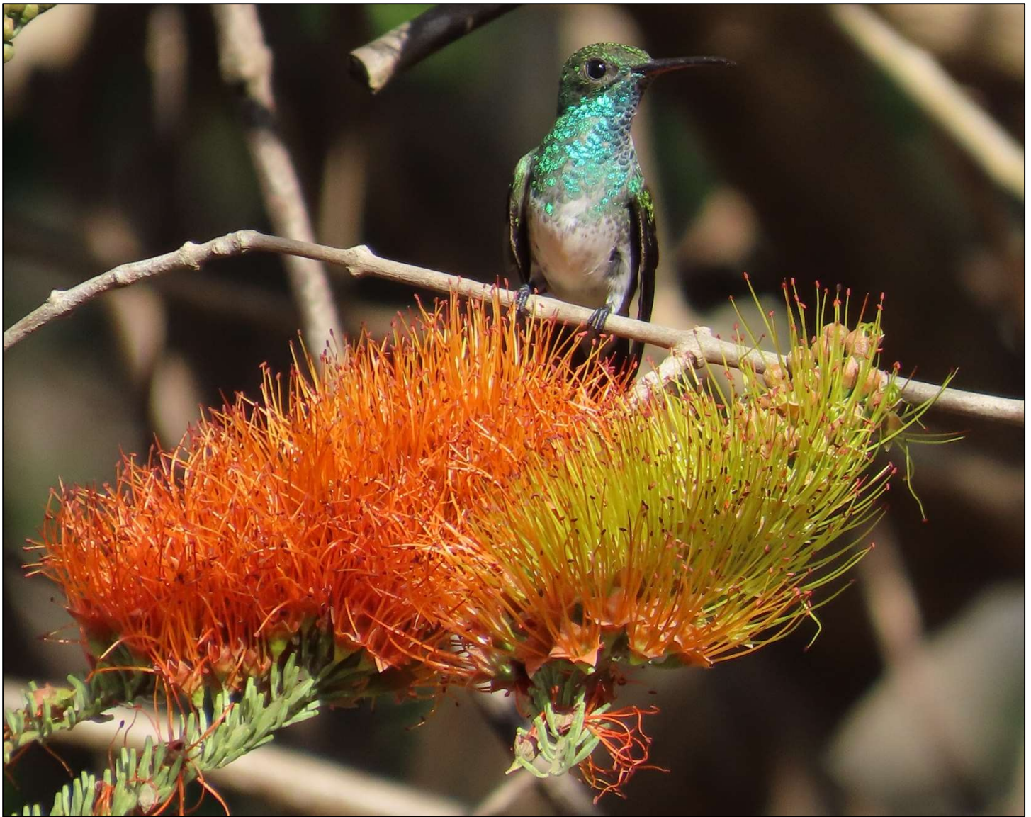
One of the best views ever of the endangered Mangrove Hummingbird, a range restricted species endemic to the Pacific Coast of Costa Rica.