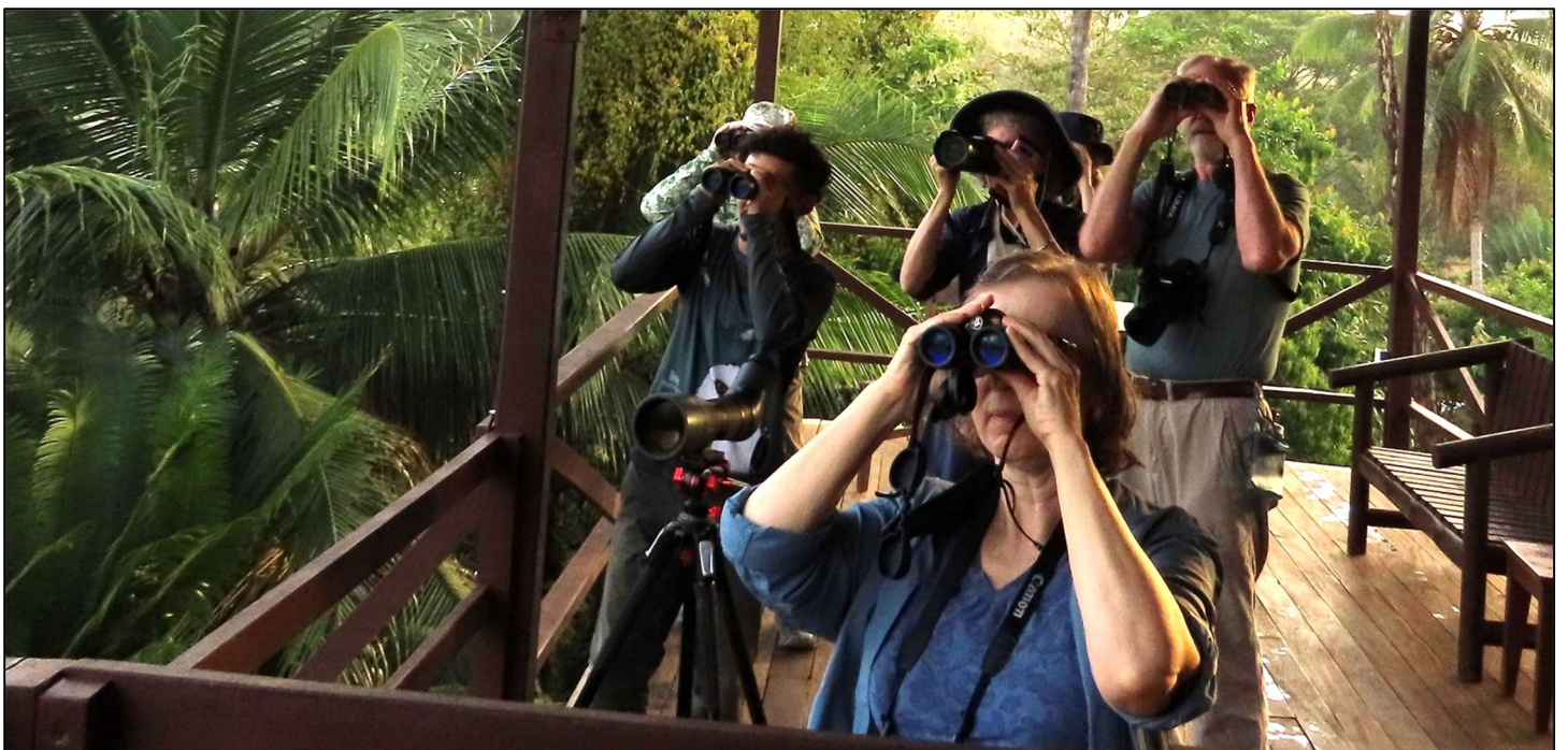
Birding from the deck at Laguna del Lagarto.