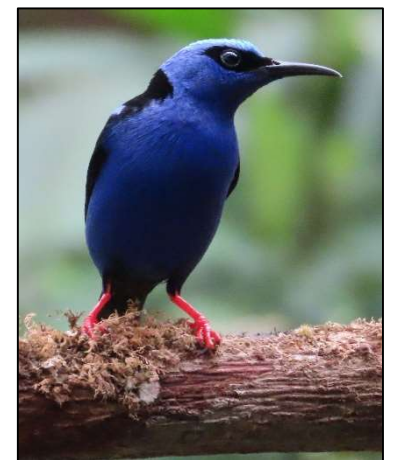
A stop at a roadside ecopark yielded a colourful array of tanagers including Crimson-collared, Green Honeycreeper and Red-legged Honeycreeper at the feeders.