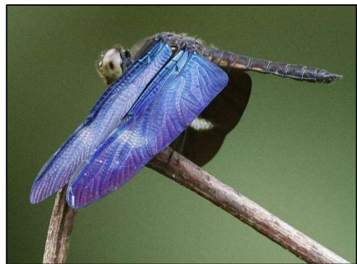
Spectacled Caiman and Amazon Sapphirewings were seen around the ponds at Laguna Lagarto.