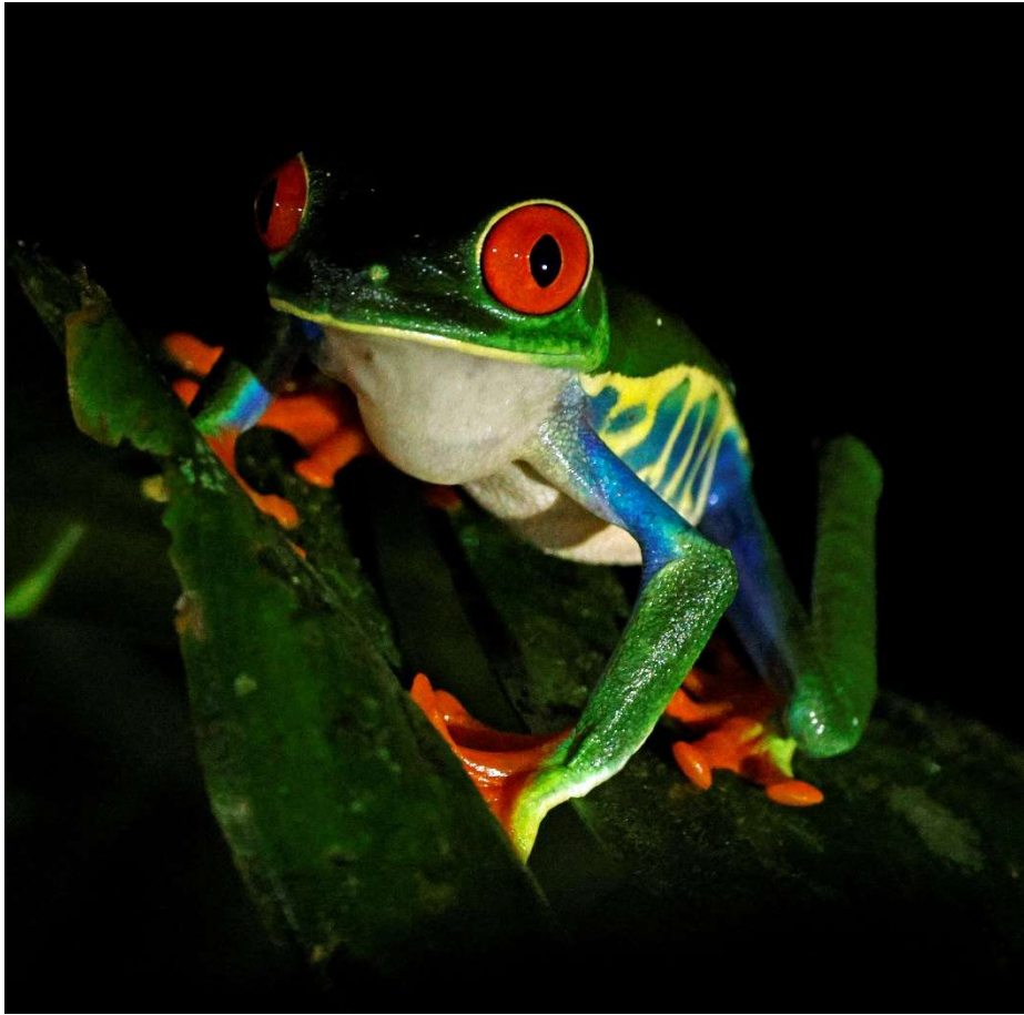
Red-eyed Tree Frog was just one of the several amphibians we saw on our night walk at Arenal.