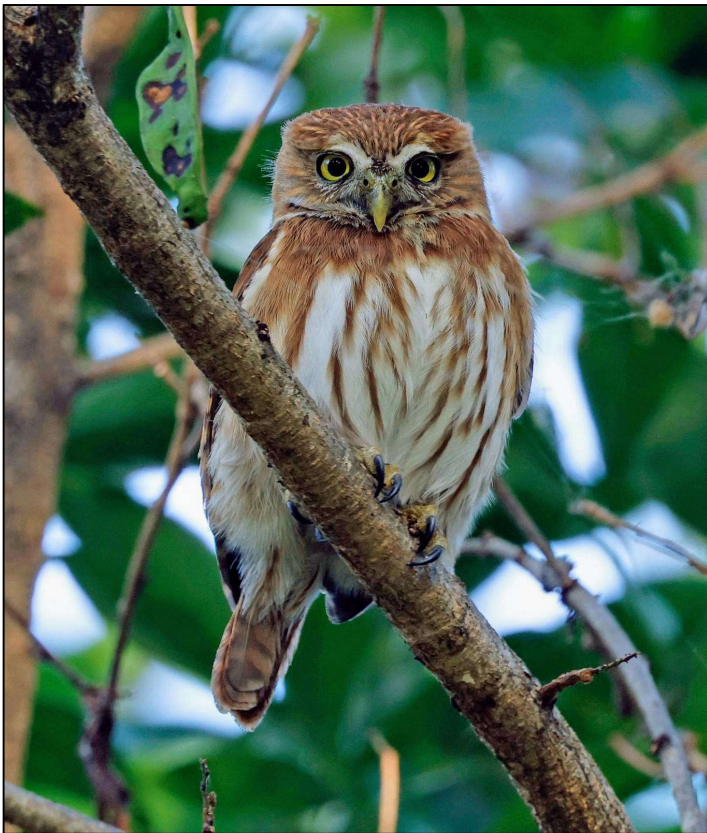
Nesting Ferruginous Pygmy Owls in our hotel grounds was a nice start to the tour!