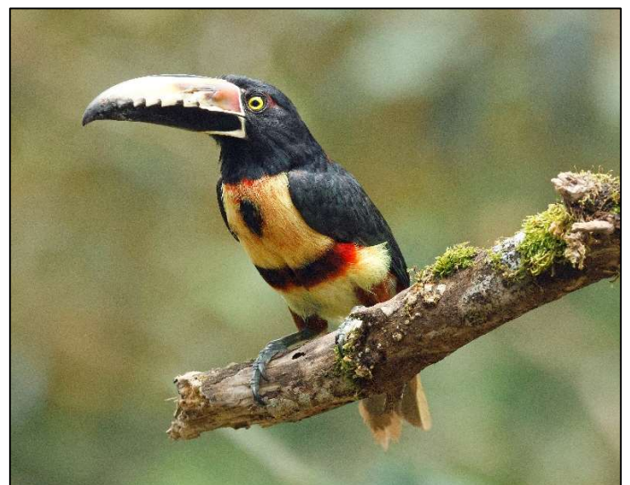
Beauty in the eye of the beholder!