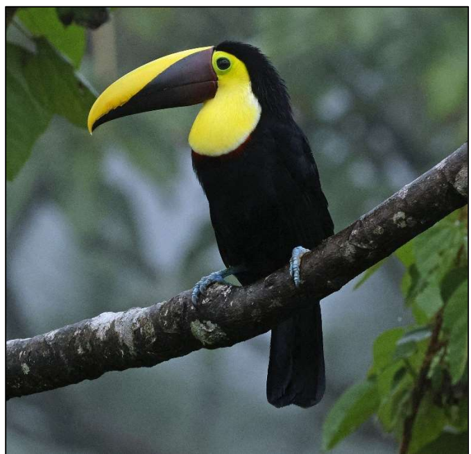
Broad-billed Motmot was a favorite at Arenal and we got our fill of Yellow-throated Toucans.