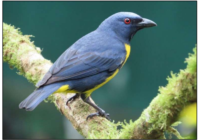
We were treated to point blank views of Emerald and Blue-and-gold Tanagers.