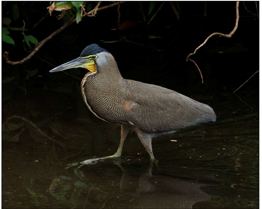
A Black-and-white Owl on a day roost was a thrill at the Bogarin Trail while a Bare-throated Tiger Heron ruled the pond.