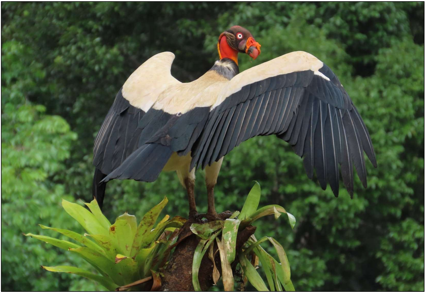
The King Vulture show at Laguna del Lagarto was a highlight for sure!