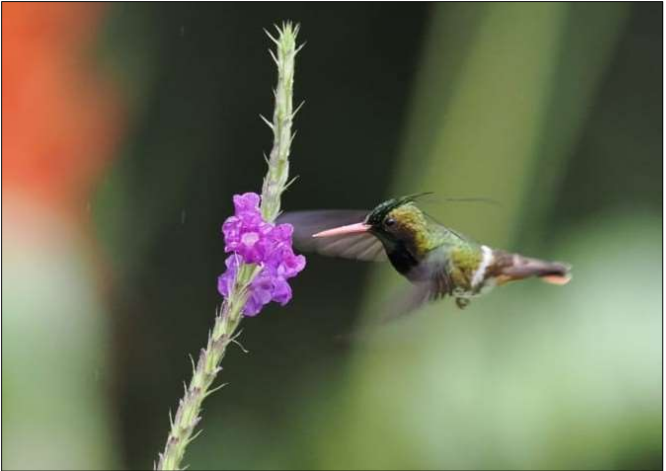
Special Hummingbirds at Arenal Observatory Lodge included this Black-crested Coquette, Violet-headed Hummingbird, White-necked Jacobin, Crowned Woodnymph, and others.