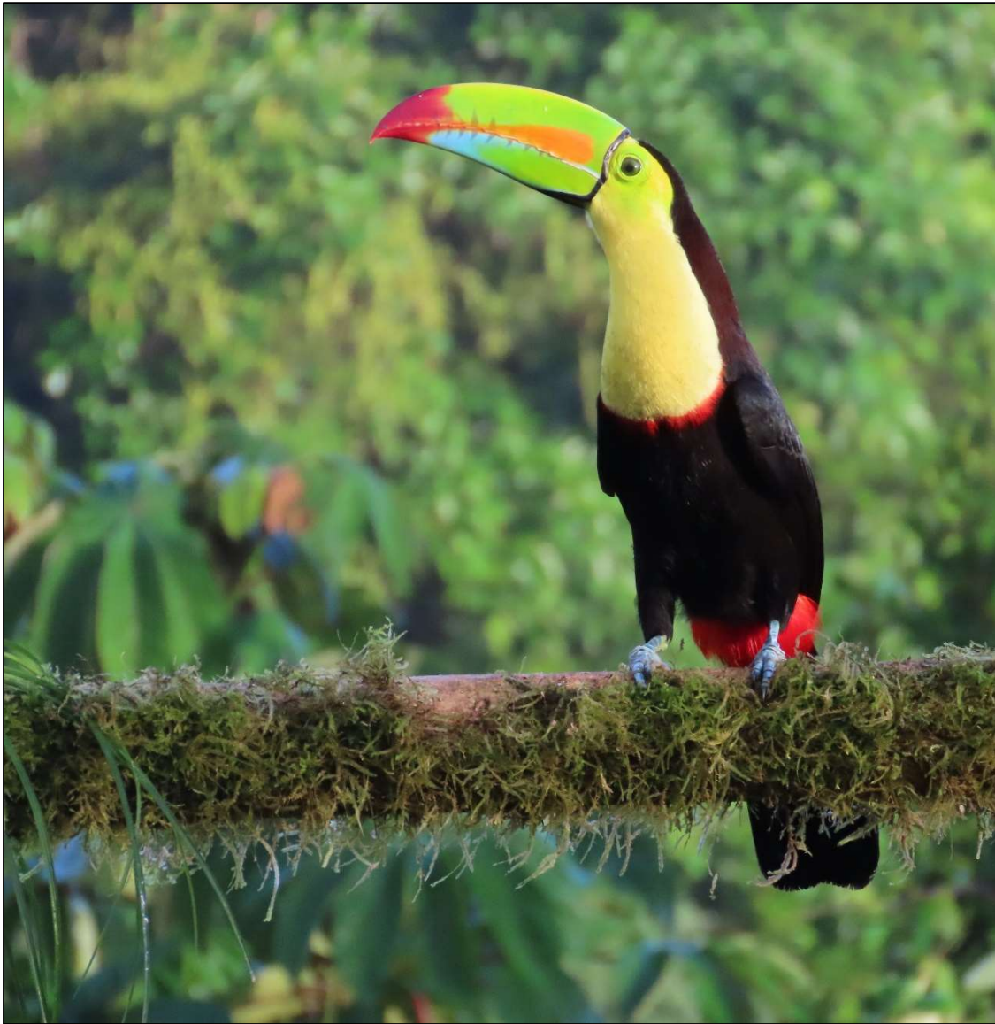
The Keel-billed Toucans at Laguna del Lagarto posed repeatedly for us!