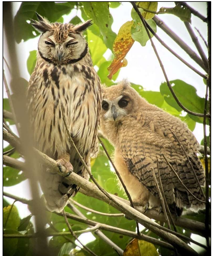
Later on in the trip, a Striped Owl with a large chick was a treat.