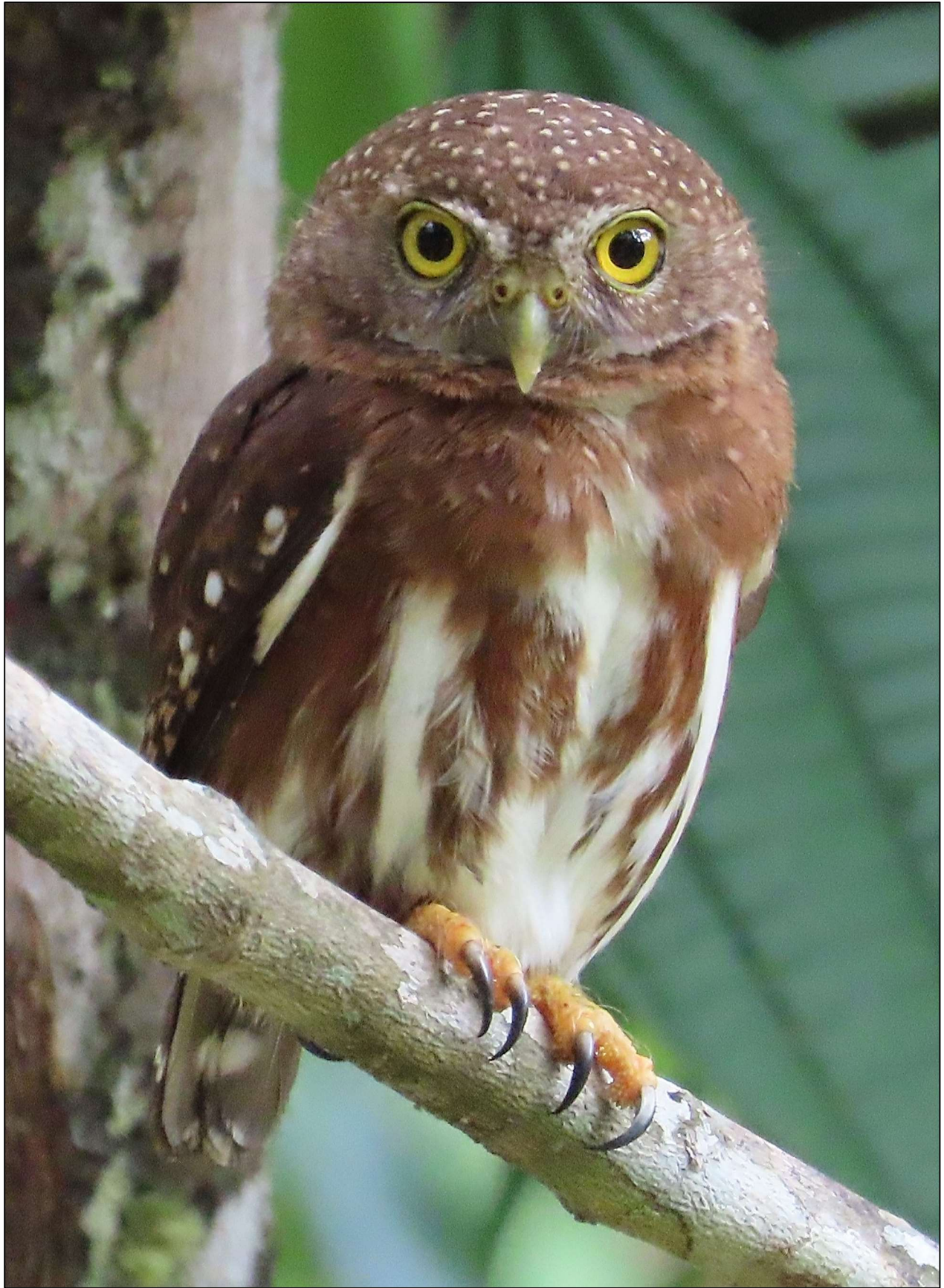
What a thrill to see a Central American Pygmy Owl up close like this.