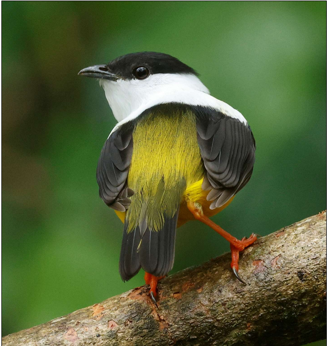
White-collared Manakins put on a great show at The Nest Nature Center.