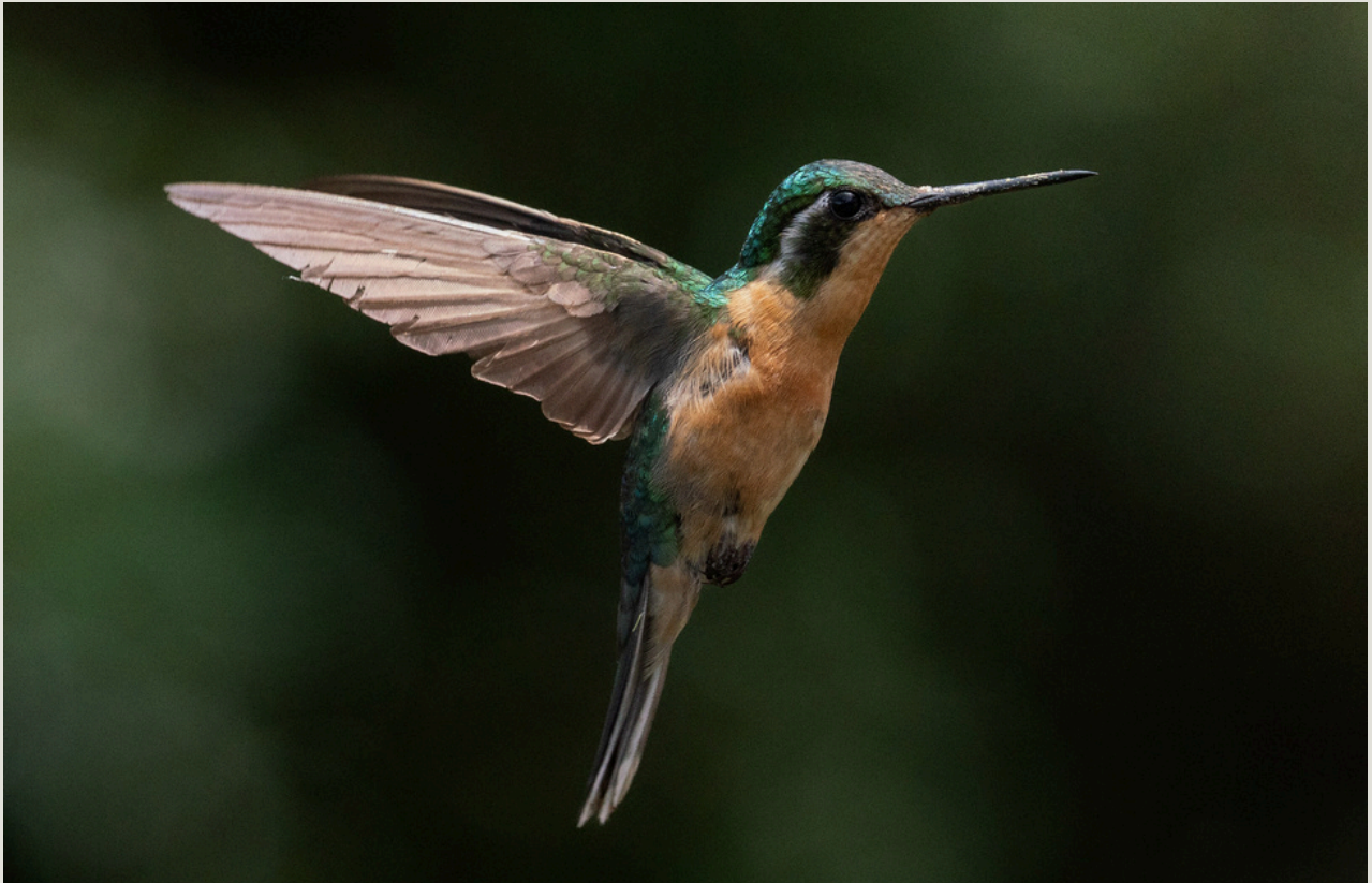
White-throated Mountain-gem. Female