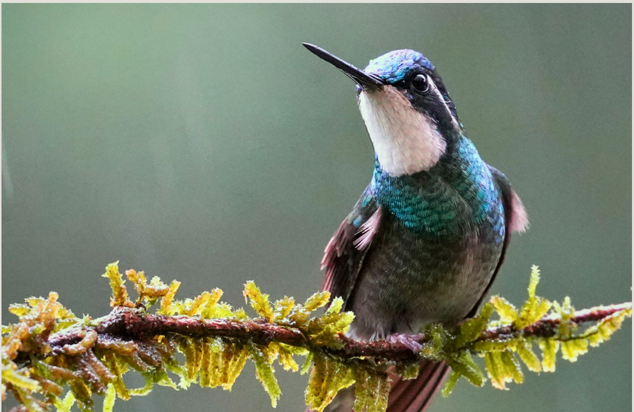
White-throated Mountain-gem. Male