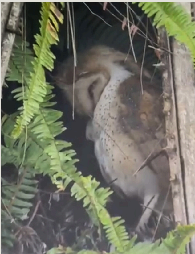
American Barn Owl